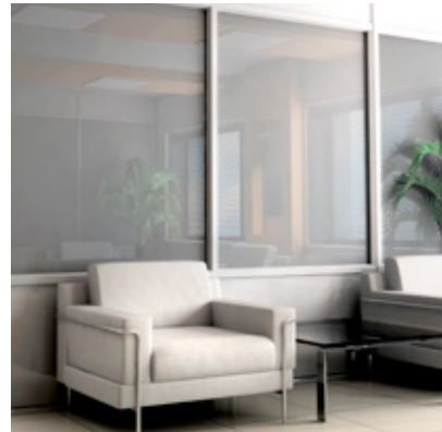
The images shown are a representation only of the product. Colour and effect may differ. Always refer to a sample to determine if product is appropriate for your requirements.