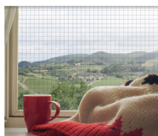
Polished Wire N