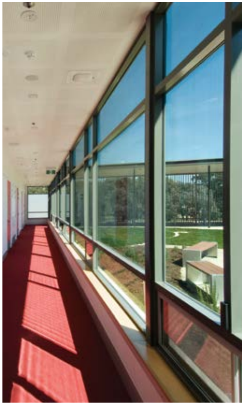
Project: Canberra Hospital Adult Mental Health Facility.