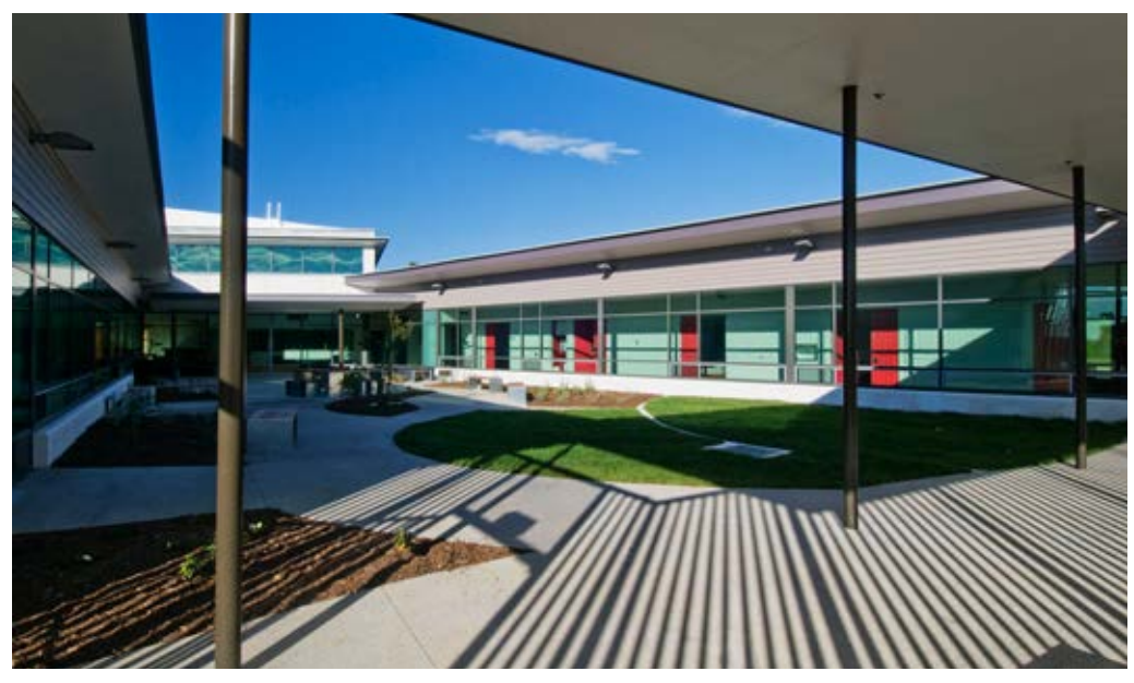
Project: Canberra Hospital Adult Mental Health Facility.

It is specifically designed for applications requiring client observation where excellent integrity of product is required. This maximum security glass is typically used in maximum risk areas in facilities such as juvenile justice centres, remand centres and acute or forensic mental health facilities.